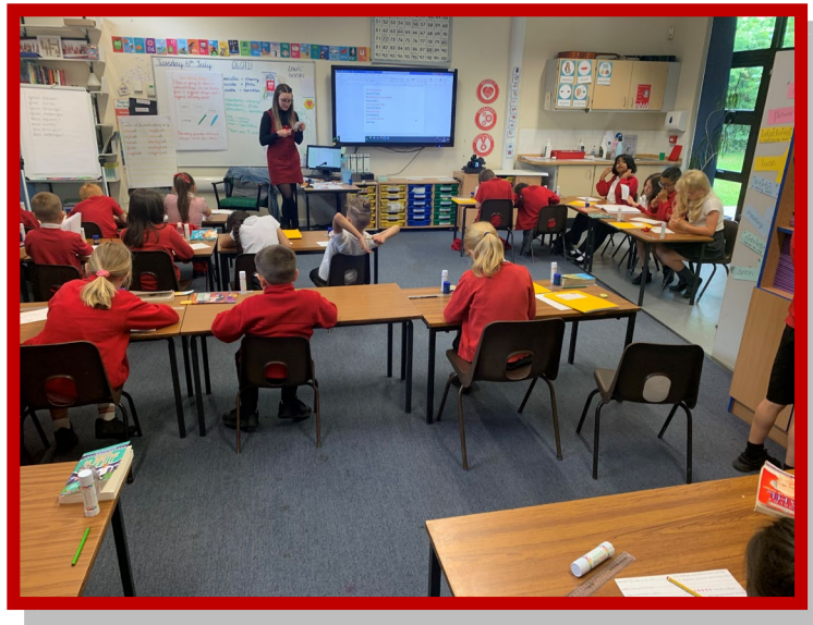
Miss Hall's Classroom